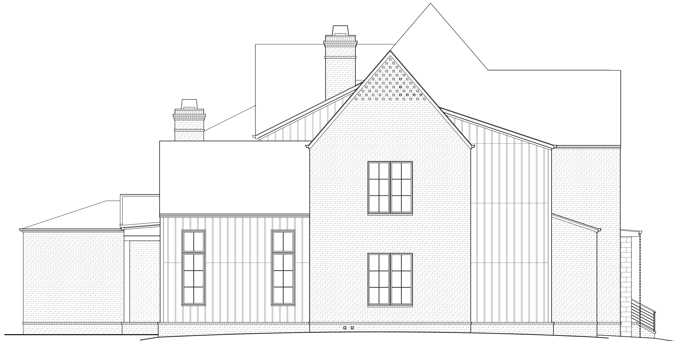
3 LEFT ELEVATION 1/4" = 1'-0"

WITHERSPOON LOT 016 9325 JOSLIN COURT GABRIELLA WI016_gabrWI LAST CHECKED: 09.19.2023 KJK