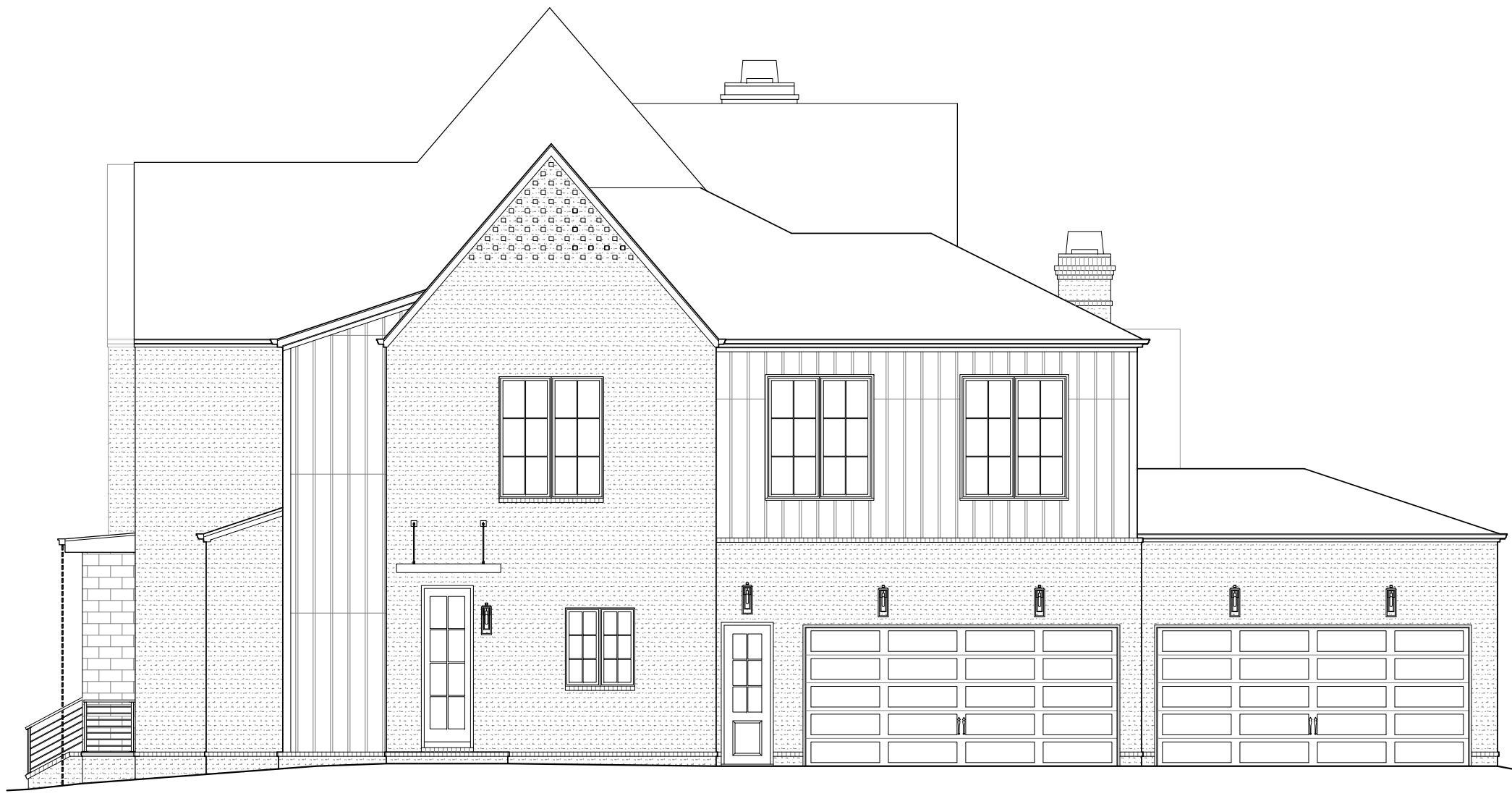
1 RIGHT ELEVATION 1/4" = 1'-0"

WITHERSPOON LOT 016 9325 JOSLIN COURT GABRIELLA WI016_gabrWI LAST CHECKED: 09.19.2023 KJK