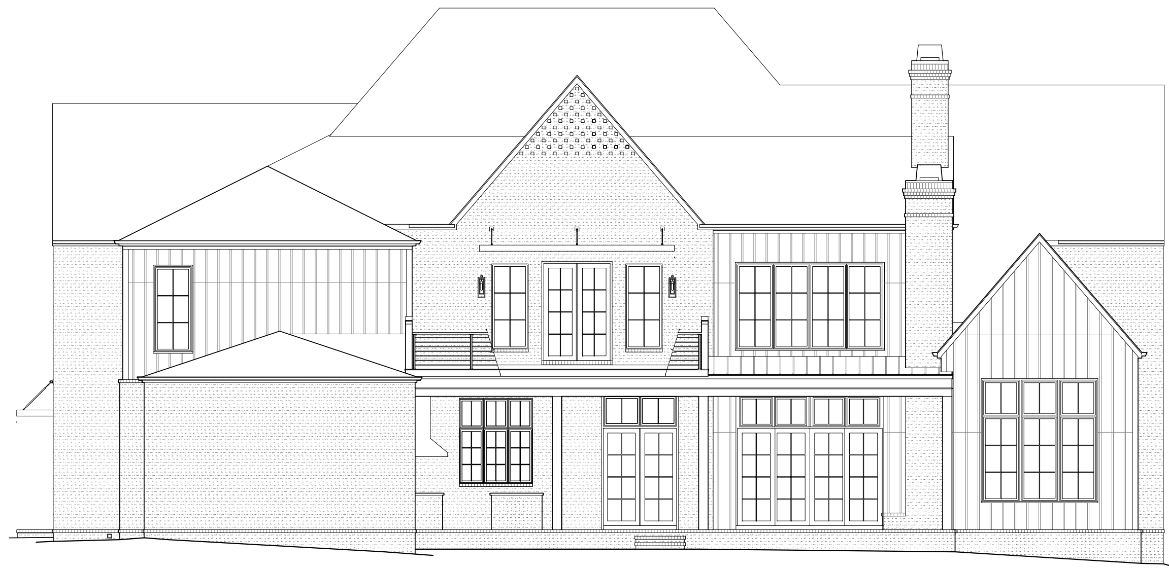
2 REAR GARAGE ELEVATION 1/4" = 1'-0"

WITHERSPOON LOT 016 9325 JOSLIN COURT GABRIELLA WI016_gabrWI LAST CHECKED: 09.19.2023 KJK