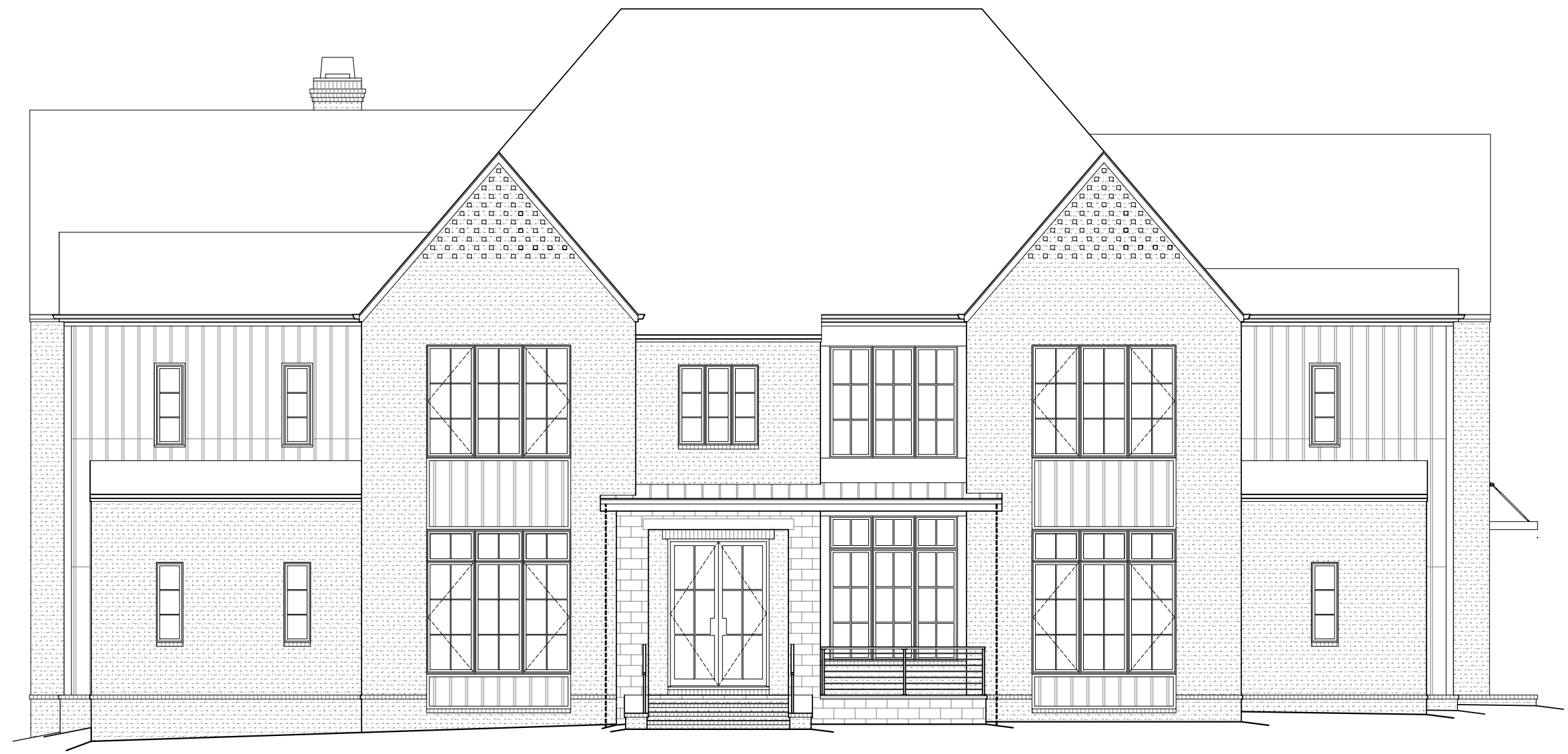
1 FRONT ELEVATION 1/4" = 1'-0"

WITHERSPOON LOT 016 9325 JOSLIN COURT GABRIELLA WI016_gabrWI LAST CHECKED: 09.19.2023 KJK