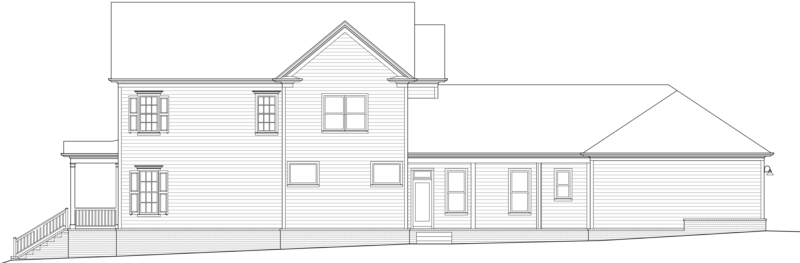
2 RIGHT ELEVATION 1/8" = 1'-0"