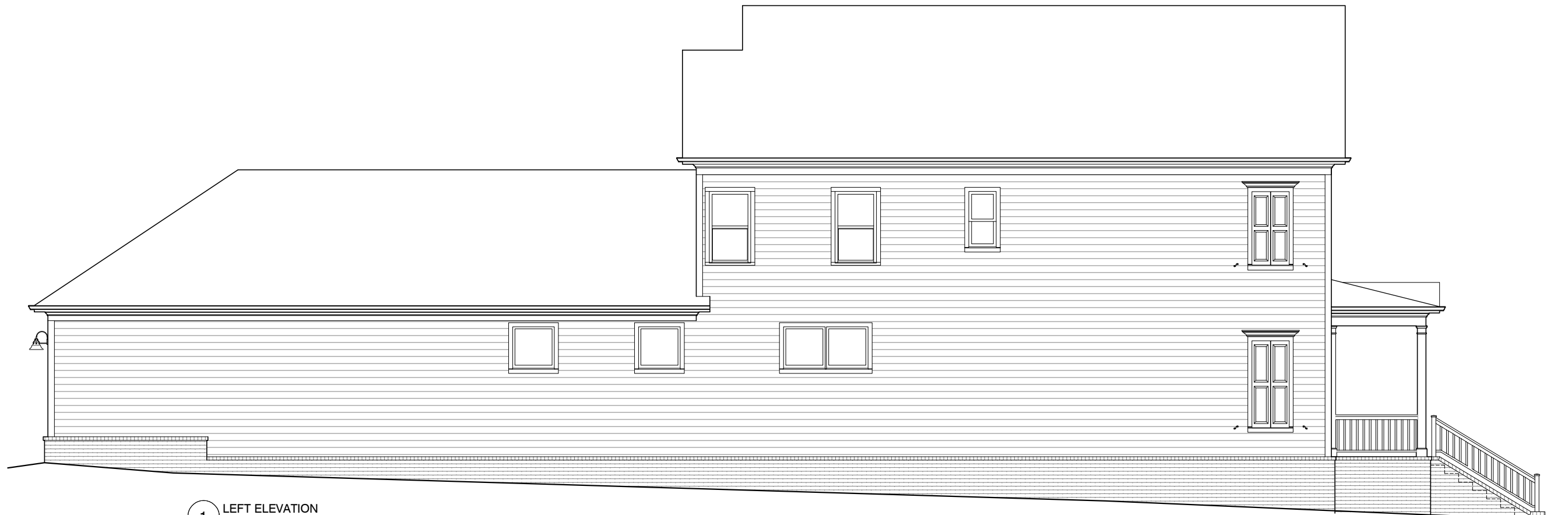
1 LEFT ELEVATION 1/8" = 1'-0"

SOUTHBROOKE LOT 163 1186 SOUTHBROOKE BLVD AMELIA 41' SB163_AmeISB41 LAST CHECKED: 12.11.2023 ARS