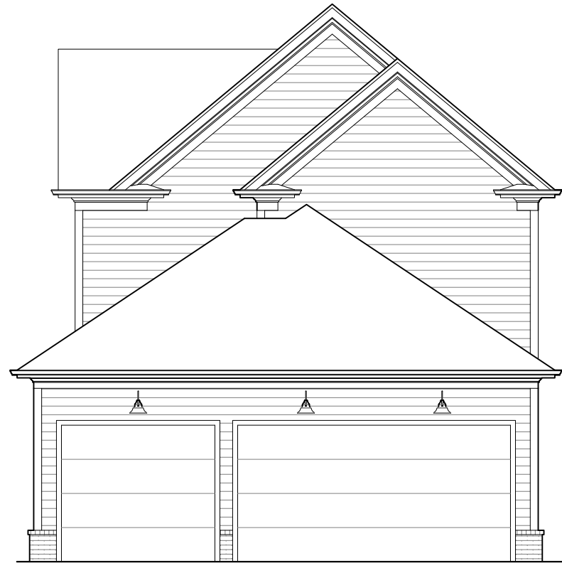
2 REAR ELEVATION 1/8" = 1'-0"